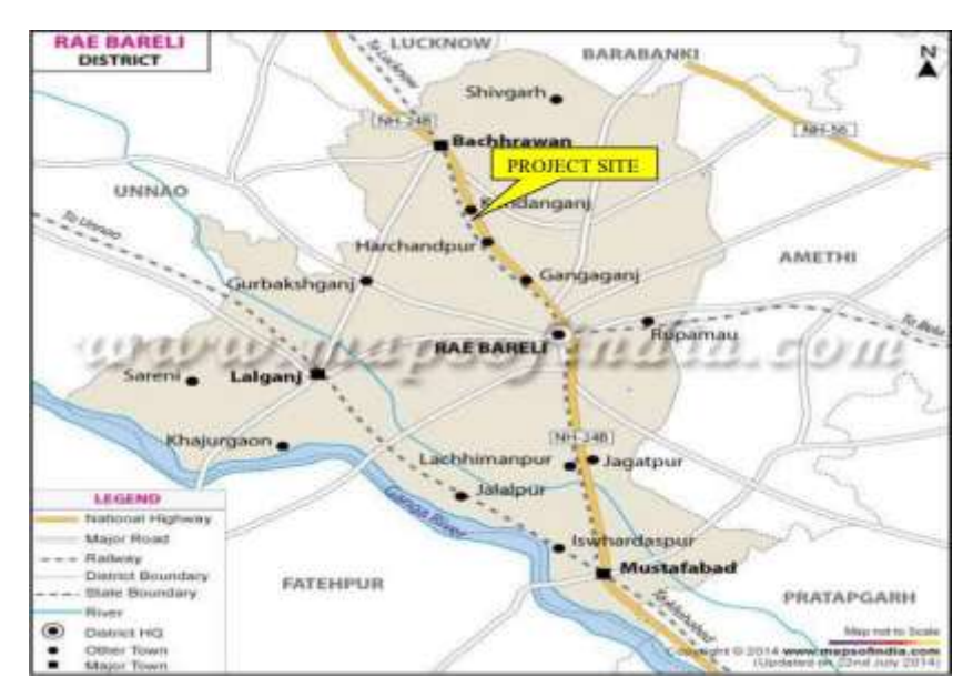
Figure 1: Location map of the study area in cement Factory, Rae Bareli.