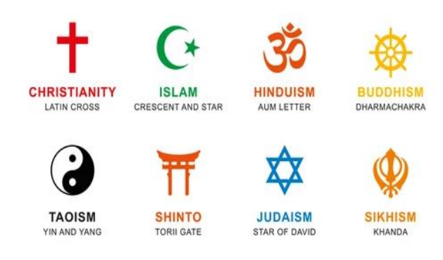
Figure 1: The Symbols of the Different Religions

In today's day, students or the younger generation are distracted and confused about the value of Vedic literature and its religion. Secularism today is not only a term but a religion. Most young people feel that Vedas (and any other religious literature in this respect) is just a collection of stories [1-4]. This article is aimed at resolving this problem, dispelling misconceptions about the Veda and shedding light on what the new age religion is, what impact does the new age religion have on the present generation, and what conclusions will this 'Secularism' guard have to make for the new generation? Veda's philosophy was astonished by the greatest of the world's scientists and thinkers [5-8]. The emblems of many religions are seen in Fig.1.