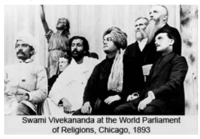
Figure 4: Swami Vivekananda During His Speech in All Religion Parliament

the basis of "manage everything" and "ideal," which with the non-segregation rule is not sustainable, is used often. Non-voting and religious government-based nations and governments preserve themselves from developing premises without the obligation to demonstrate their vision. This does not directly raise the question of the interpretation of this privilege, but it is not the same as the broad range of other rights it has defined, such as business, training, articulate opportunity and tranquil gathering.