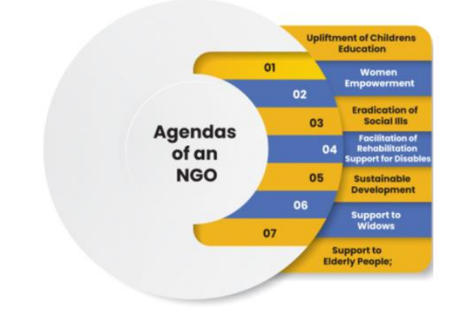
Figure 7: NGO Working Criteria to Bring the Changes in Society[1]