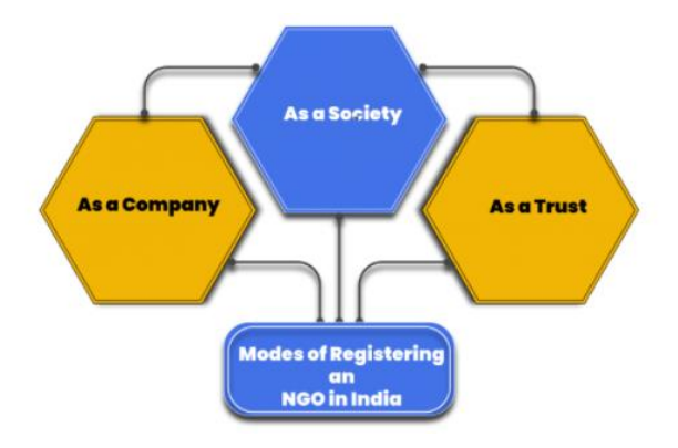
Figure 6: Modes of Registration of A NGO[7]

These value propositions are closely linked to multidimensional construction of e-commerce features, and are founded on the rationale that such capabilities show "firm's capacity to deploy and utilize ecommerce money to assist order cycle activities." These approaches, we think, allow businesses to convert their resources into specified value offers in flow direction market (Fig.6). We anticipate ecommerce capabilities to be positively linked to specialized ecommerce marketing skills, based on prior research on resource–capability linkage[8].