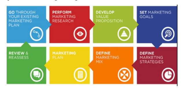
Figure 1: Key Points to Be Considered While Plan a Marketing Strategies for a Sustainable Business[1]

Marketing strategies are the most essential as well as vital factors for growth and development of an organisation regardless the location of the manufacturing unit in addition to the services available of that business. Marketing methods are the main element in distinguishing of performance of an organisation amongst the individuals and also enhance the business income structure by growing its client base (Fig.1). There are various nongovernmental organisation are also working to increase the living standard of the people by making the action that will help them to think high as well as live high ,therefore, there moral highness and keenness to achieve big in the customer orientated world solely depends upon the marketing strategies.