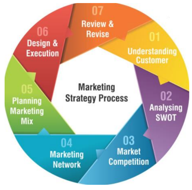
Figure 4: A Critical Step By Step Framework for Marketing Planning [3]