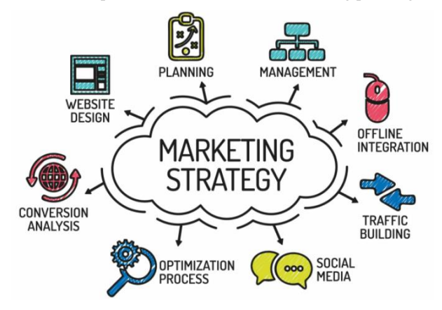
Figure 2: Tools to Be Used To Implement In Framework of a Marketing Planning [2]

The non-governmental organisations are the organisation which involved in the welfare of the society in term of many aspects such as education, living standard, social myths, corruption etc. and also involved in same business activities to raise the fund for the social causes and also provide the jobs to the needed person. In the context of the Indian background, there are many problems might be seen in the society and these problem must be address with full enthusiasm to curb the problem, despite this, government is not a single body who will take responsibility for all the problems in the society along with in a life of an individual but it is collective responsibility to take a step to solve the problems. Therefore, many individuals step forward to establish an organisation that is known as the nongovernmental organisation to work jointly in the groups for the benefit of others. Fig. 2 illustrates tools to be used to implement in framework of a marketing planning.