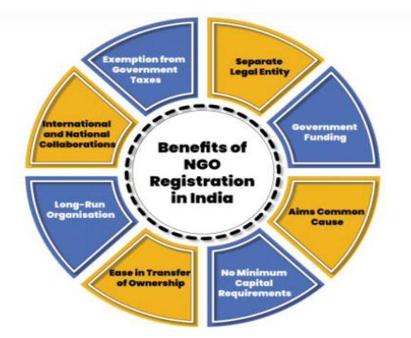
Figure 5: Benefits of Registration of aNGOs